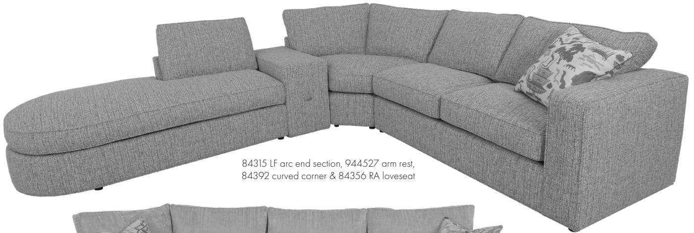
84315 LF arc end section, 944527 arm rest, 84392 curved corner & 84356 RA loveseat