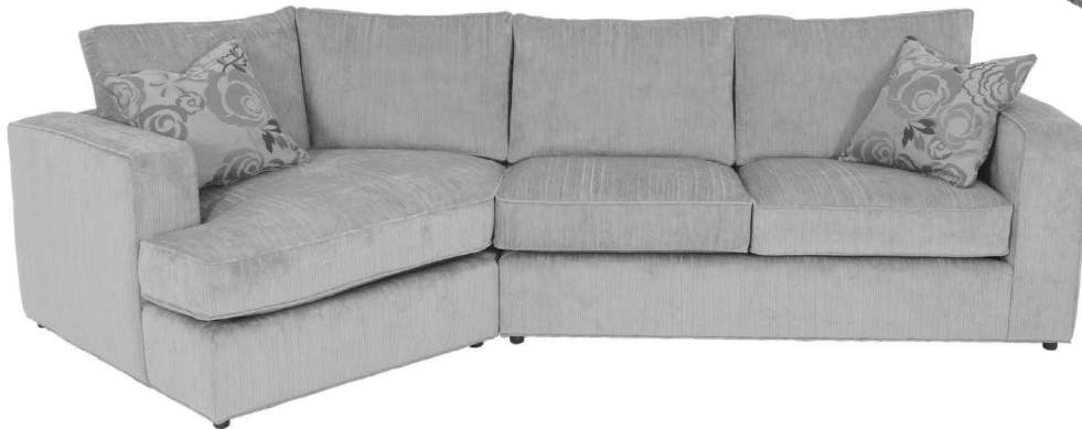
84397 LA angle cuddle chaise & 84356 RA loveseat