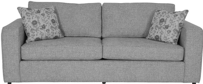
84380 long sofa